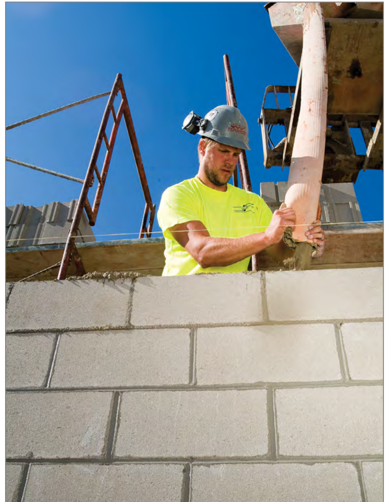
SPEC MIX SCG reduces labor by eliminating consolidation and reconsolidation of masonry grout.

SPEC MIX Core Fill Grout is a dry, preblended mix with high flow. Formulated to fill masonry voids, it meets ASTM C476 requirements for reinforced masonry construction. SPEC MIX Core Fill Grout is a fluid cementitious material that bonds